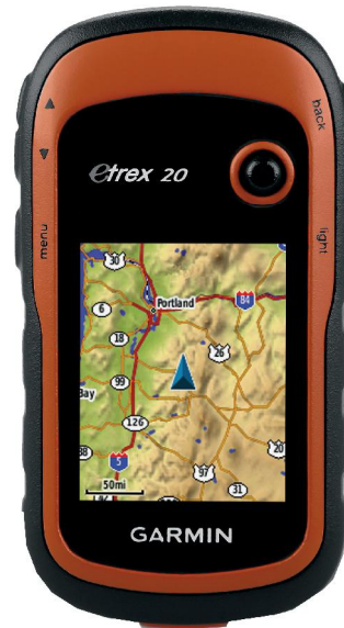
eTrex 20 190$*

Equipped with a high sensitivity GPS receptor compatible with WAAS and with the prevision system HotFix, they calculate quickly and accurately your position and maintain it even in densely wooded areas.