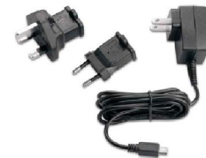
10723-12 AC charger