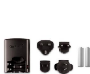
11343-00 Rechargeable NIMH Battery kit