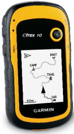
eTrex 10 115$*