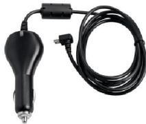
10581-11 12 volt cable