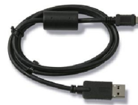
10723-15 USB Cable