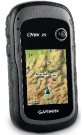
eTrex 30 285$*