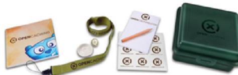
11663-00 Official Geocaching Pack