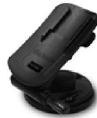
11031-00 Marine mount