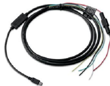
11131-00 Direct Cable