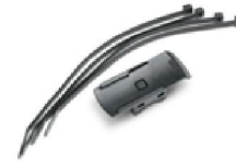
11023-00 Bike Mount